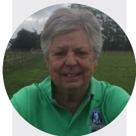
NATIONAL CHAMPIONSHIPS CHAIR