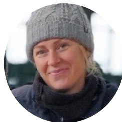
NATIONAL CHAMPIONSHIPS ADMINISTRATOR