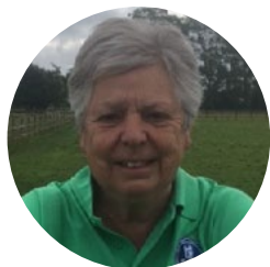
NATIONAL CHAMPIONSHIPS CHAIR