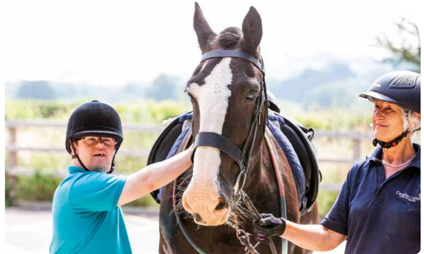
RDA President, Her Royal Highness The Princess Royal writes